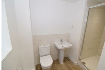
En-Suite Shower Room 10'0" x 6'0" (3.07 x 1.85)