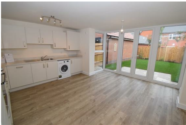
Kitchen/Diner 18'4" x 15'10" (5.59 x 4.83)