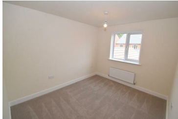
Bedroom 2 11'11" x 9'0" (3.64 x 2.75)