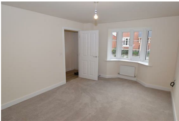
Lounge 16'2" x 10'9" (4.93 x 3.29)