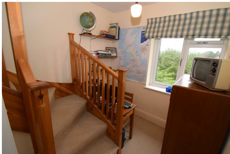
Study 9'3" x 7'2" (including stairs) (2.84 x 2.20 (including stairs))

With a double glazed rear window, radiator and stairs rising to the third bedroom.