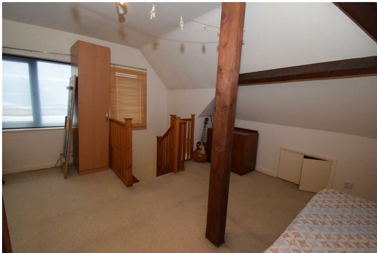
Bedroom 3 16'10" x 15'9" overall (5.14 x 4.82 overall)

Converted loft space which has been used as a bedroom since 2001. With exposed beams, two double glazed side windows and a range of storage cupboards.