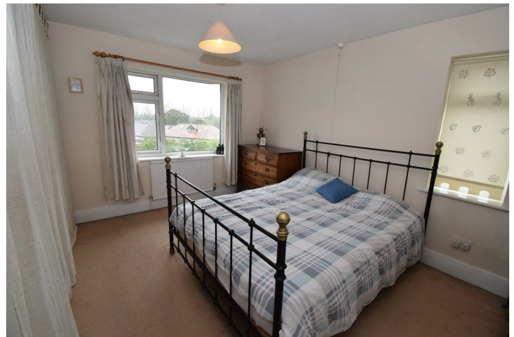
Bedroom 1 13'5" x 11'10" (includes wardrobes) (4.11 x 3.62 (includes wardrobes))

Rear double bedroom overlooking the garden. With double glazed side and rear windows, an open wardrobe, feature fireplace and a radiator.