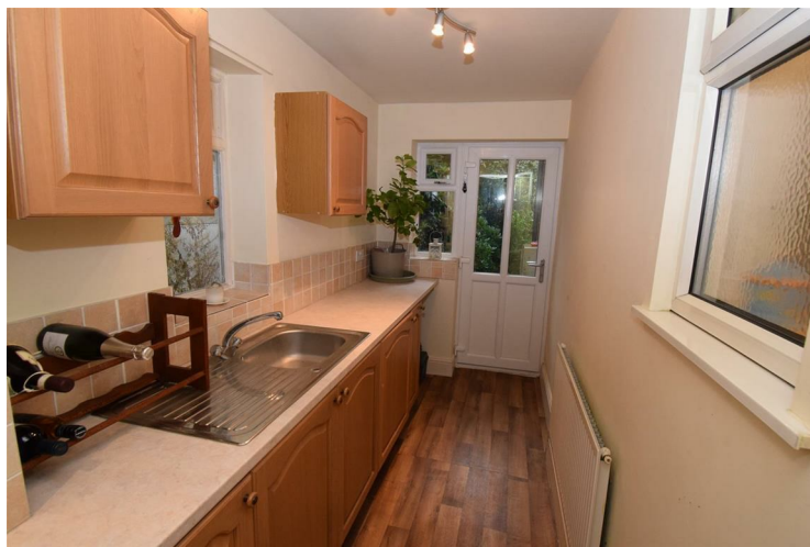
Utility Room 13'1" x 5'1" (4.00 x 1.55)

Useful utility area with a range of fitted base and wall units, with worktops and an inset sink and drainer with a mixer tap and tiled splashbacks. There is space and plumbing for washing machine, wall mounted gas boiler, a radiator, double glazed door opening onto the rear garden and side and rear windows.