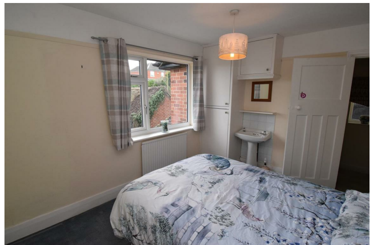
Bedroom 2 11'10" x 10'4" (includes cupboard) (3.63 x 3.15 (includes cupboard))

Front double bedroom with fitted wardrobes and a built in airing cupboard housing the hot water cylinder. Pedestal wash hand basin, traditional picture rail, a radiator and double glazed front and side windows.