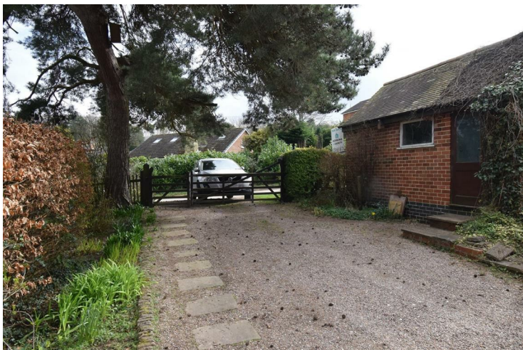
Gated Front Driveway

To the front of the property there is a gated driveway providing off road parking. Access to the entrance door and a side entry leading to the rear garden.