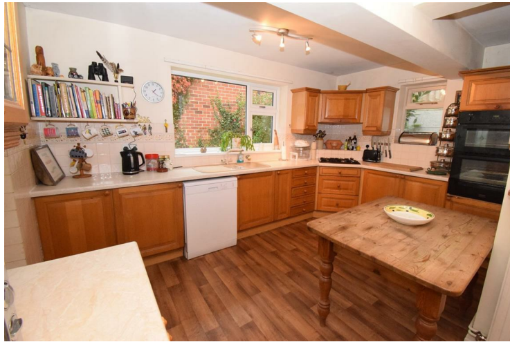
Kitchen/Breakfast Room 16'2" x 13'8" overall (4.93 x 4.17 overall)

Accessed via a leaded light double glazed entrance door. Fitted with a range of base and wall units, with work surface areas and an inset one and a quarter sink and drainer with a mixer tap and tiled splashbacks. There is a built in double electric oven, gas hob and hood; along with space for a fridge/freezer and plumbing for a dishwasher. Fitted storage cupboard, a radiator, double glazed front and side windows, opening to the utility room and doors leading off.