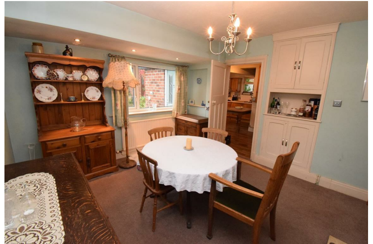
Dining Room 13'6" x 11'10" (4.12 x 3.63)

Formal dining room with double glazed front and side windows providing natural lighting. Built in storage cupboard and display shelving. Radiator, ceiling spotlights and a feature fireplace.