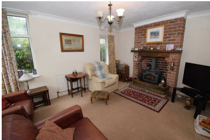
Lounge 16'2" x 13'5" x 11'11" (4.95 x 4.11 x 3.64)

With a feature brick fireplace housing a log burning stove. Two radiators, coving to the ceiling and double glazed side and rear windows.