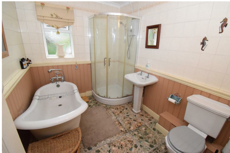
Bath/Shower Room 9'3" x 7'1" (2.84 x 2.17)

Fitted with a four piece suite comprising a lovely "slipper" style free standing bath with a shower attachment; separate corner shower enclosure, pedestal wash hand basin and WC. Tiled splashbacks and flooring, a heated towel rail, coving to the ceiling, an extractor vent and a double glazed front window.