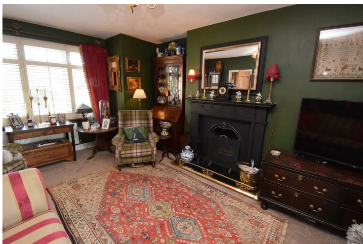
Lounge Area 16'11" x 11'11" (5.16 x 3.64)

With a decorative open fireplace, radiator and double