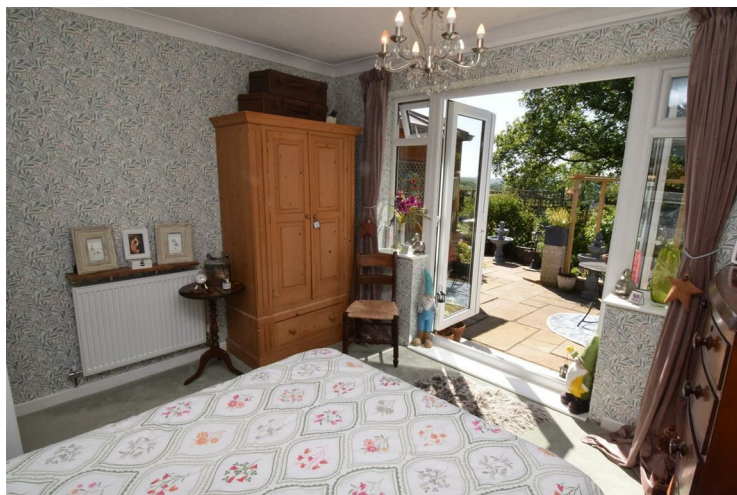
Bedroom 2 11'11" x 12'0" (3.64 x 3.66)

Rear double bedroom with a radiator, coving to the ceiling and double glazed French doors with side panels opening onto the rear patio and garden.