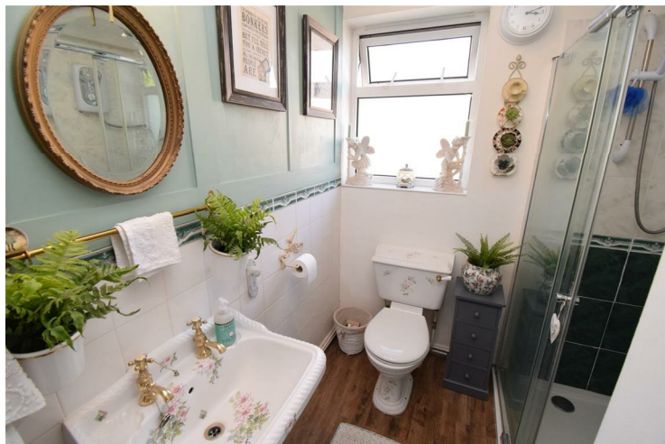
En-Suite Shower Room 8'5" x 6'2">3'6" (2.57 x 1.89>1.09)

Three piece suite comprising double shower, wash hand basin and WC. Luxury vinyl tile flooring, decorative tiled splashbacks, a heated towel rail, coving to the ceiling and a double glazed side window.