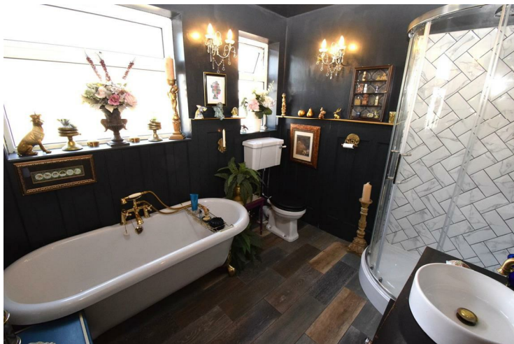
Bath/Shower Room 9'3" x 7'10" (2.82 x 2.41)

Four piece suite comprising roll top bath with a mixer tap and shower attachment; corner shower, vanity wash hand basin and WC. Attractive tiled flooring, a designer radiator and two double glazed side windows.