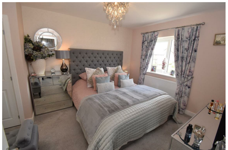
Master Bedroom 10'11" x 10'7" (3.33 x 3.25)

Large master bedroom with a radiator and double glazed front window.