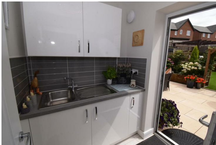
Utility Room 5'11" x 5'3" (1.81 x 1.61)

Useful utility room with a fitted worktop and inset sink and drainer. There is an integrated tumble dryer/washing machine, tiled flooring, a radiator, extractor vent and a double glazed door opening onto the rear garden.