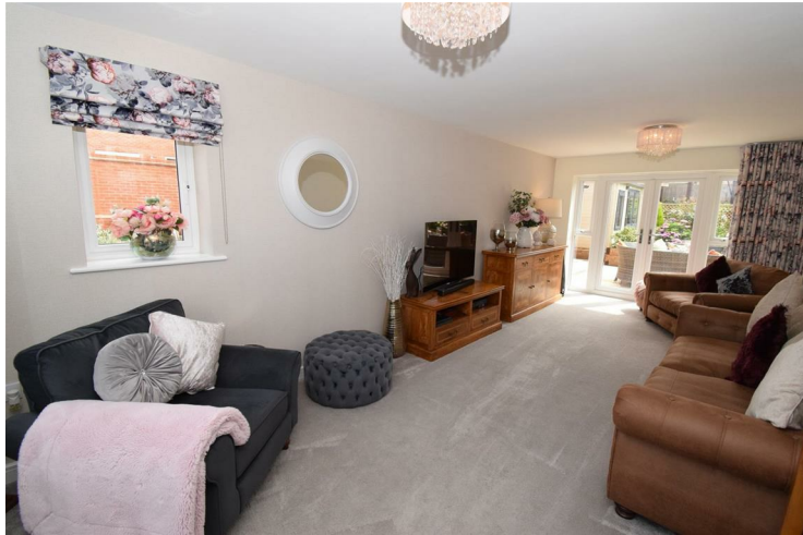
Lounge 23'0" x 10'6" (7.02 x 3.22)

Generous family sitting room with two radiators and double glazed front and side windows providing ample natural lighting. A set of French doors with side panels open onto the rear patio and garden.