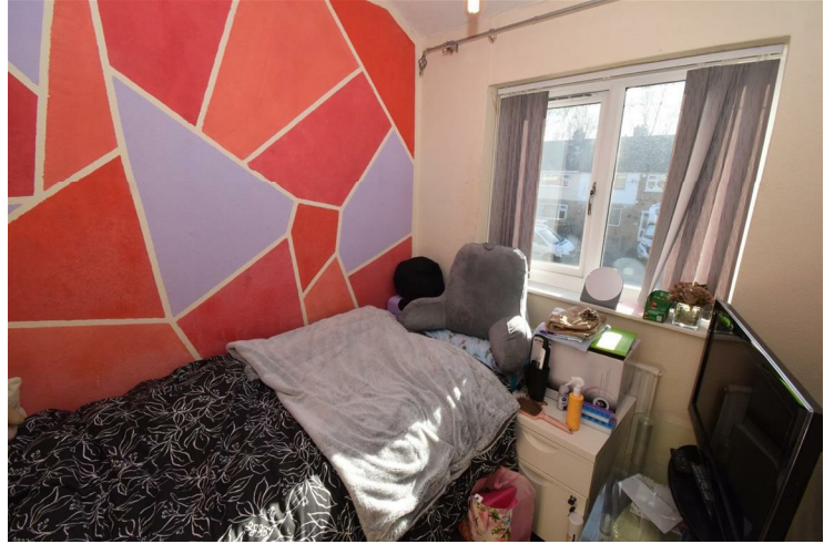
Bedroom 3 8'0" x 6'8" (2.44 x 2.05)

Single third bedroom with a radiator and double glazed front window.