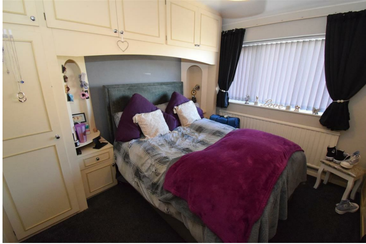
Bedroom 1 12'3" x 11'2" (3.74 x 3.42)

Measurements include the wardrobes. Rear double bedroom with a range of fitted wardrobes and cupboards over, a matching dressing table and drawers. Radiator, wall mounted gas boiler within a cupboard and a double glazed rear window.