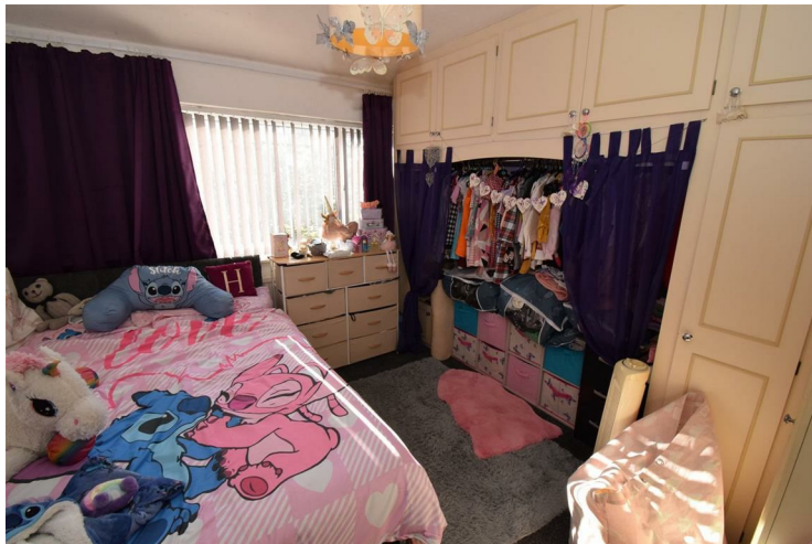
Bedroom 2 11'1" x 10'4" (3.40 x 3.15)

Measurements include the wardrobes. Front double bedroom with a range of fitted wardrobes with cupboards over and drawers. A radiator and double glazed front window.