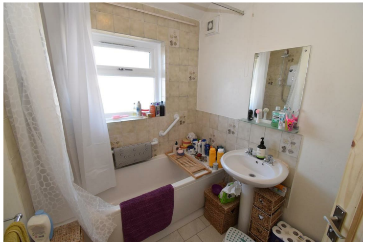
Bathroom 7'5" x 5'11" (2.28 x 1.81)

Three piece suite comprising bath with an electric shower over, wash hand basin and WC. Tiled splashbacks, a radiator, extractor vent and a double glazed rear window.