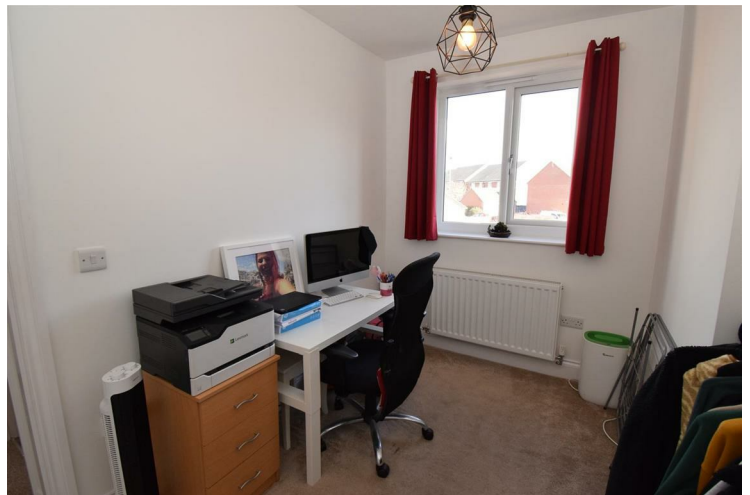
Bedroom 2 10'9" x 7'10">6'8" (3.29 x 2.41>2.04)

Rear double bedroom with a radiator and double glazed window.