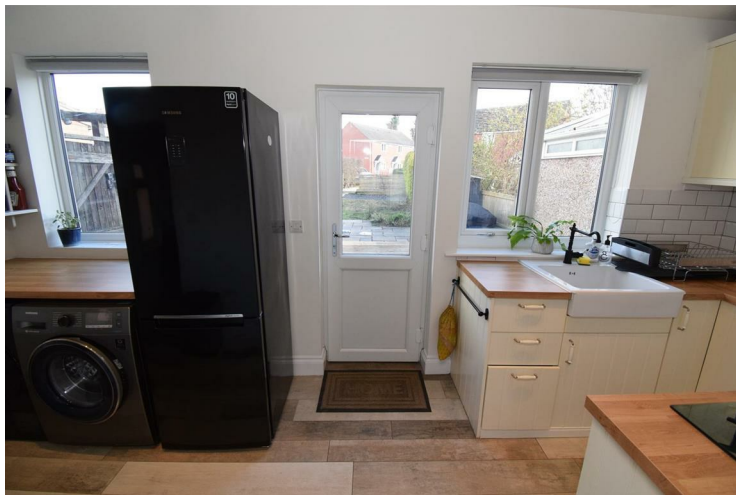
Kitchen 16'3" x 6'9" (4.97 x 2.06)

Spanning the full width of the property with a stylish range of base and wall units; attractive worktops and an inset Belfast sink with a mixer tap. There is a built in electric oven, five ring gas hob and hood, along with space for a fridge/freezer, tumble dryer and plumbing for a washing machine. Tiled flooring and decorative tiled splashbacks, a radiator, two double glazed rear windows and a double glazed door opening onto the garden. Access to a walk in under stairs storage cupboard/pantry with shelving and a further double glazed side window.