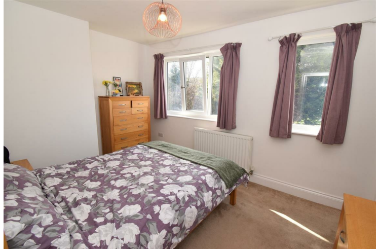
Bedroom 1 13'3">12'0" x 9'4" (4.05>3.67 x 2.85)

Front double bedroom with a radiator, two double glazed windows and a walk in wardrobe.