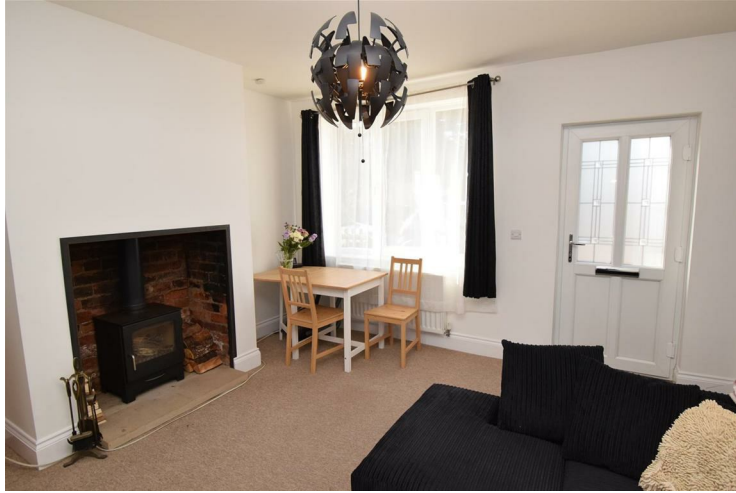
Lounge/Diner 13'3" x 13'1" (4.06 x 4.01)

Accessed via a leaded light double glazed entrance door. With a feature fireplace housing a log burning stove, radiator, double glazed front window and stairs rising to the first floor. Opening to: