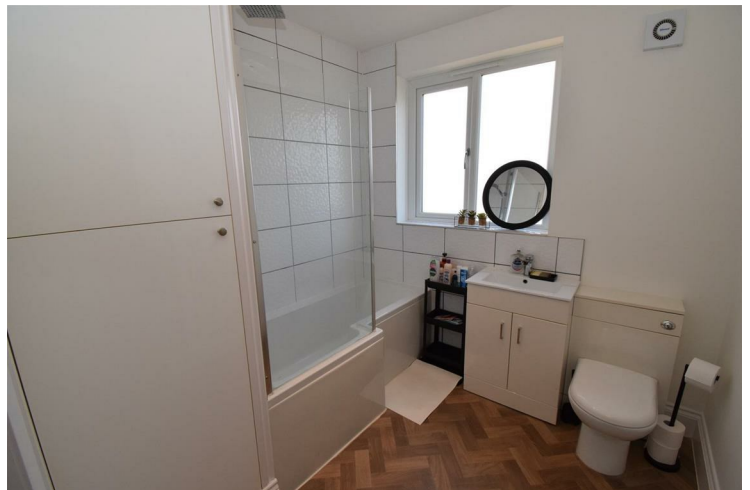
Bathroom 8'0" x 7'10" (2.45 x 2.40)

Measurement includes the cupboard. Three piece suite comprising bath with a shower over and