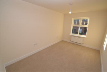
Bedroom 2 12'11" x 8'8" (3.95 x 2.66)