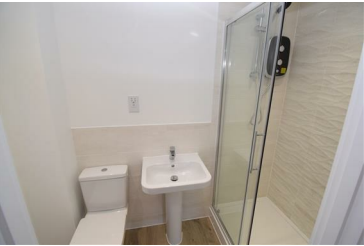
En-Suite 7'8" x 6'6" (2.35 x 1.99)