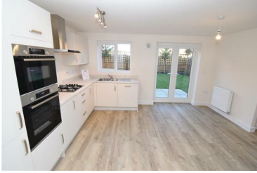
Kitchen/Diner 14'3" x 12'4" (4.35 x 3.78)