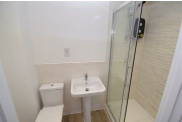
En-Suite 7'8" x 6'6" (2.35 x 1.99)