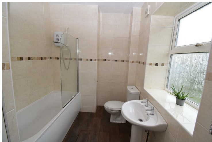
Bathroom 9'7" x 6'9" max./overall (2.94 x 2.08 max./overall)

Fitted with a stylish three piece suite comprising bath with a shower over and screen, wash hand basin and WC. Tiled walls, a heated towel rail, extractor vent and a double glazed rear window. There is also a built in storage cupboard with shelving and the wall mounted gas boiler.