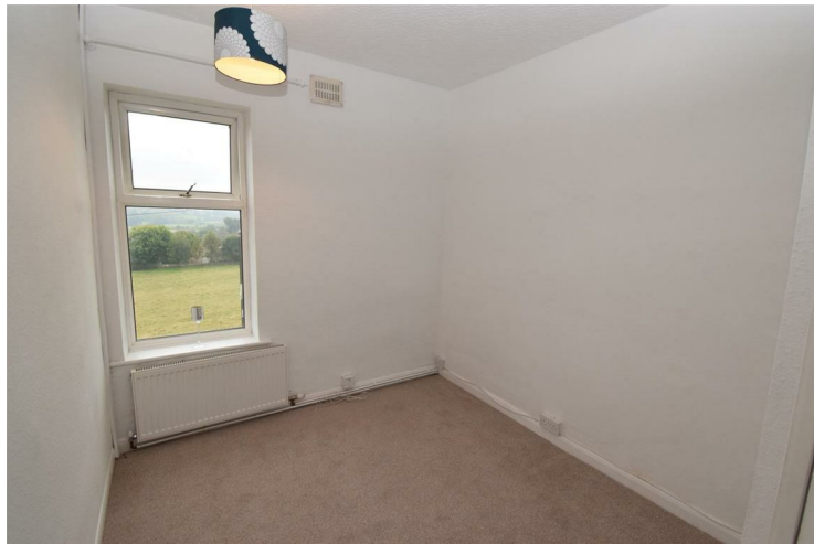
Bedroom 2 11'4">8'3" x 8'0" (3.46>2.54 x 2.45)

Good size second bedroom with a radiator and double glazed front window, again with stunning countryside views.