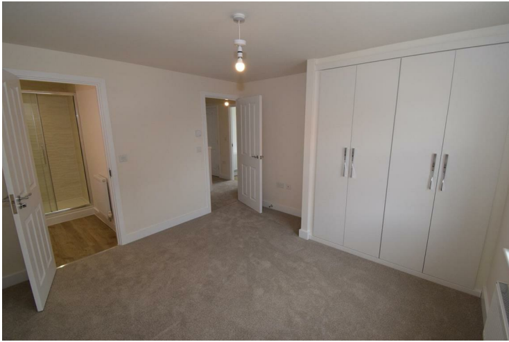
Master Bedroom 11'7 x 11'10 (3.53m x 3.61m)