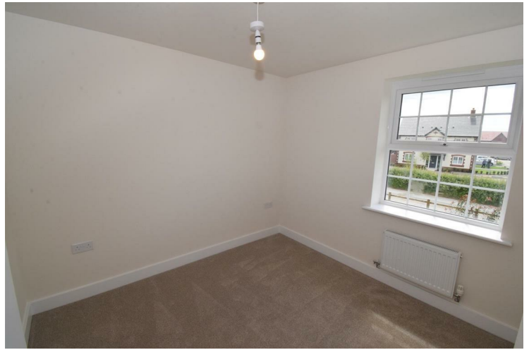
Bedroom 4 10'2 x 11'1 (3.10m x 3.38m)