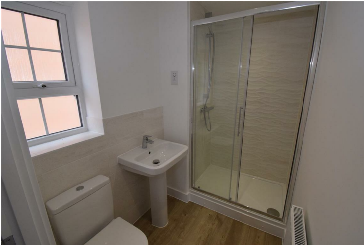
En-Suite 7'3 x 4'8 (2.21m x 1.42m)