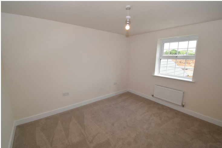
Bedroom 2 11'6 x 11'8 (3.51m x 3.56m)