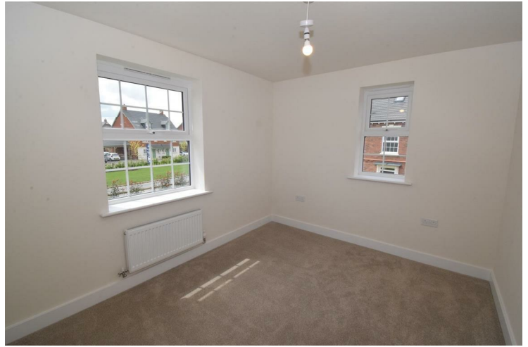
Bedroom 3 11'7 x 9'0 (3.53m x 2.74m)