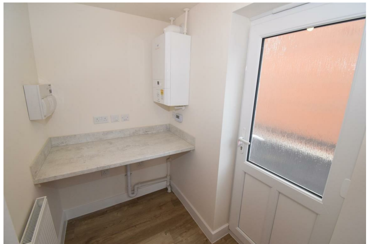
Utility 7'3 x 4'6 (2.21m x 1.37m)