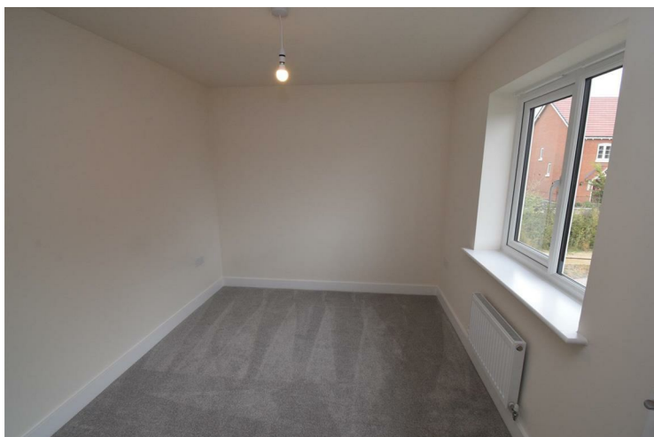
Bedroom 2 10'11" x 8'5" (3.35 x 2.58)