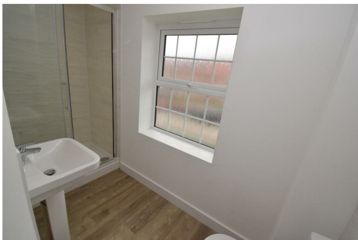
En-Suite 9'10" x 5'10" (3.01 x 1.80)