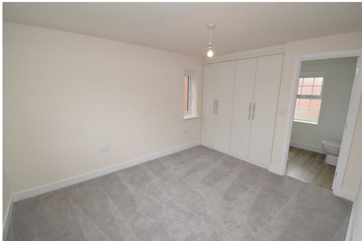
Master Bedroom 13'10" x 9'10" (4.23 x 3.01)