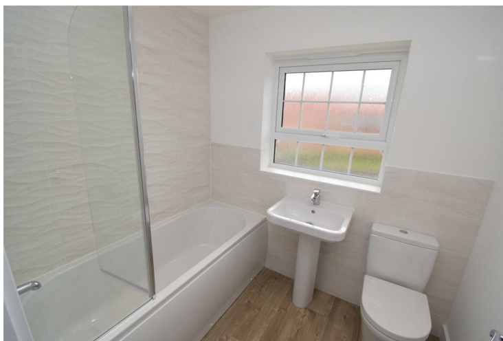
Bathroom 7'1" x 5'6" (2.17 x 1.70)