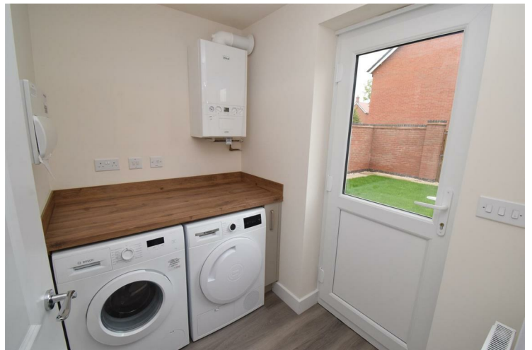
Utility Room 6'7" x 4'8" (2.03 x 1.44)