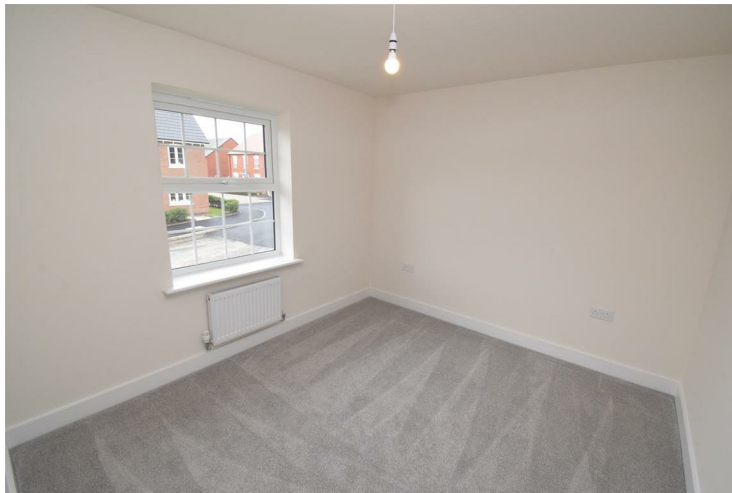
Bedroom 3 10'11" x 9'4" (3.35 x 2.85)