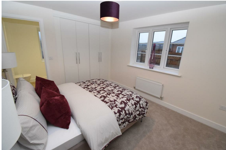
Master Bedroom 9'10" x 13'10" (3.01 x 4.23)