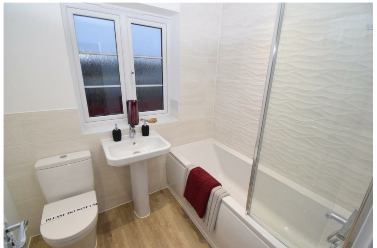
Bathroom 7'1" x 5'6" (2.16 x 1.70)