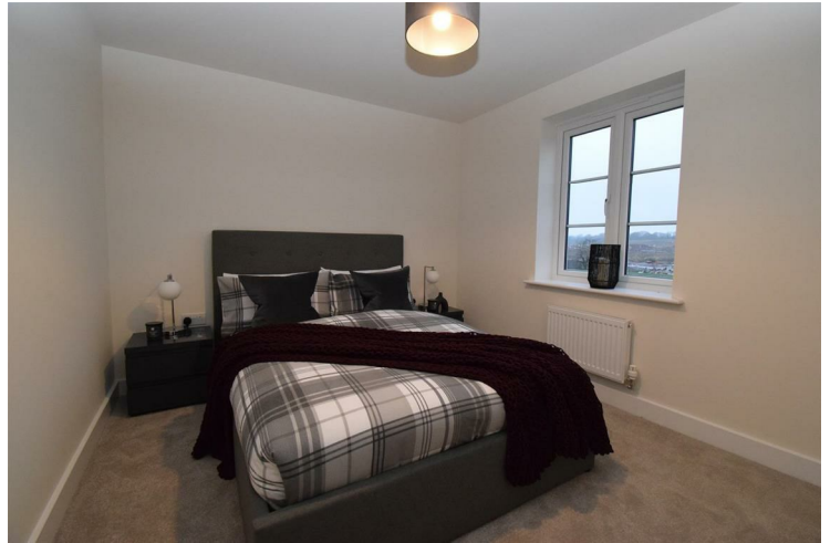
Bedroom 3 11'0" x 9'1" (3.36 x 2.78)