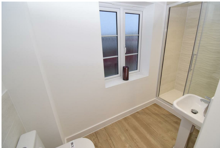
En-Suite 9'10" x 5'10" (3.01 x 1.80)