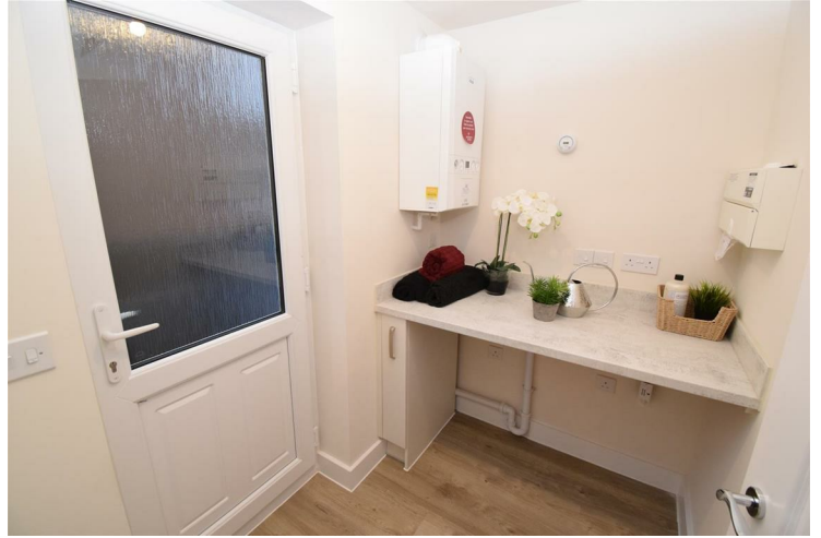
Utility Room 6'3" x 4'10" (1.93 x 1.48)