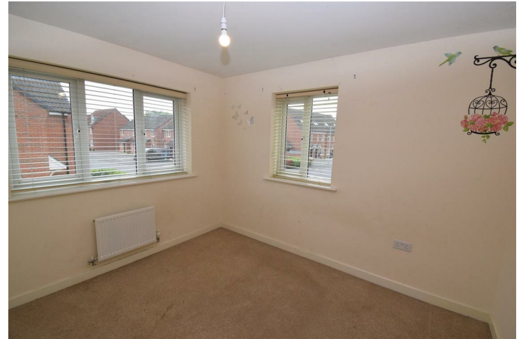
Second double bedroom with double glazed front and side windows and a radiator.

Generous L-shaped master bedroom with a radiator, double glazed front window and door to: