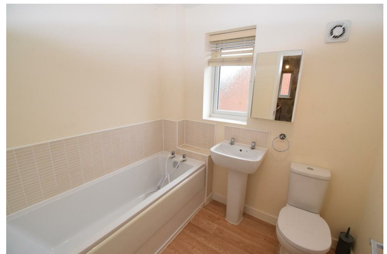
Three piece suite comprising bath with a shower over, wash and basin and WC. Tiled splashbacks, a radiator,