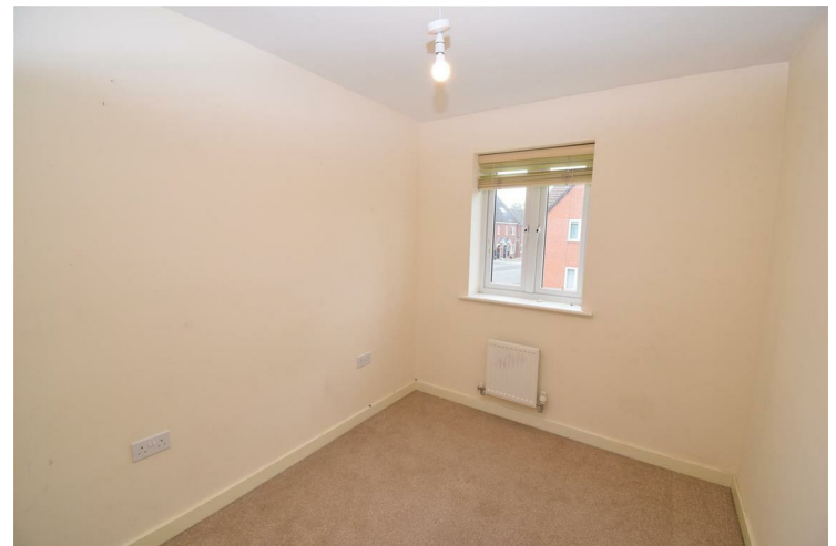
A good sized third bedroom, with a radiator and double glazed side window.

Three piece suite comprising shower, wash hand basin and WC. With tiled splashbacks, a heated towel rail, extractor vent and a double glazed side window.