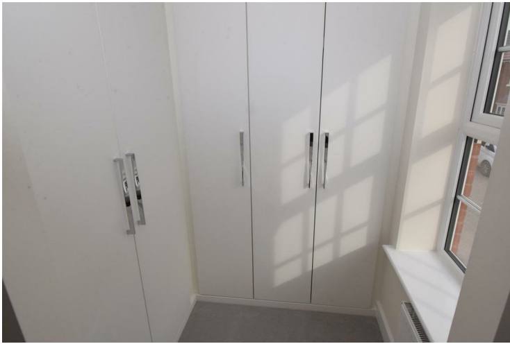
Dressing Room 7'9" x 4'5" (2.37 x 1.35)