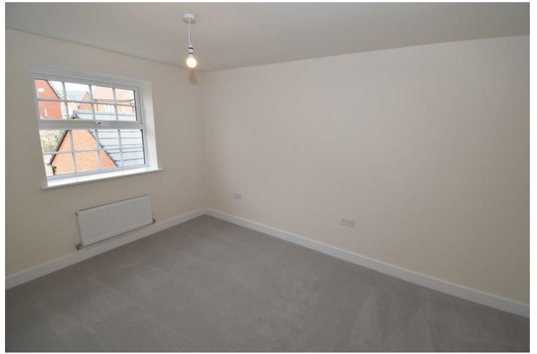
Bedroom 3 13'7" x 8'7" (4.15 x 2.64)