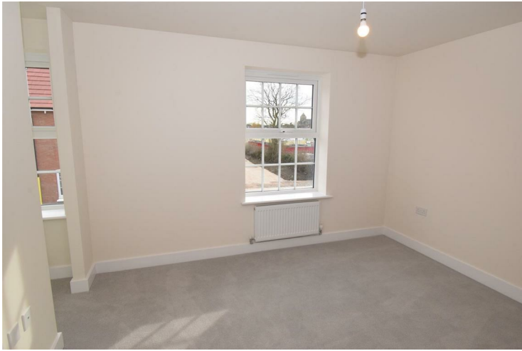
Master Bedroom 11'6" x 11'2" (3.52 x 3.41)