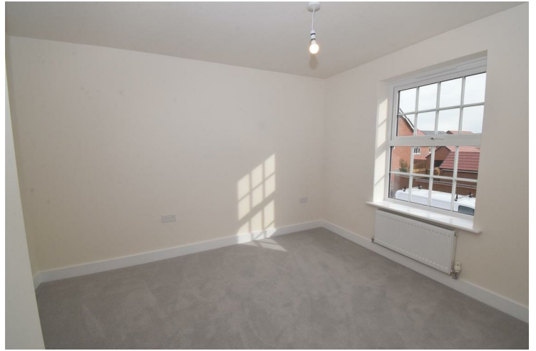
Bedroom 2 11'11" x 11'3" (3.64 x 3.43)