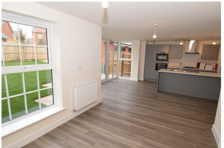
Kitchen/Diner 27'0" x 16'4" (8.23 x 4.98)