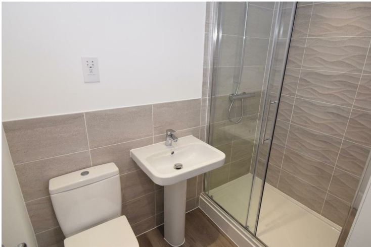
En-Suite 6'1" x 5'10" (1.86 x 1.80)