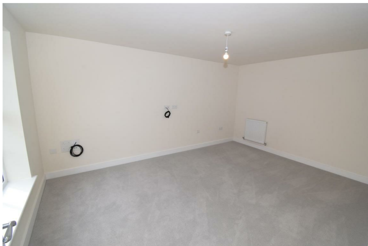
Lounge 15'3" x 11'0" (4.65 x 3.36)