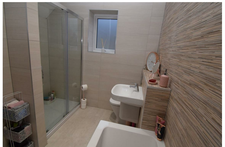
Four piece suite comprising double shower enclosure, panel bath, wash hand basin and WC. Tiled walls, heated towel rail, electric underfloor heating, ceiling spotlights,