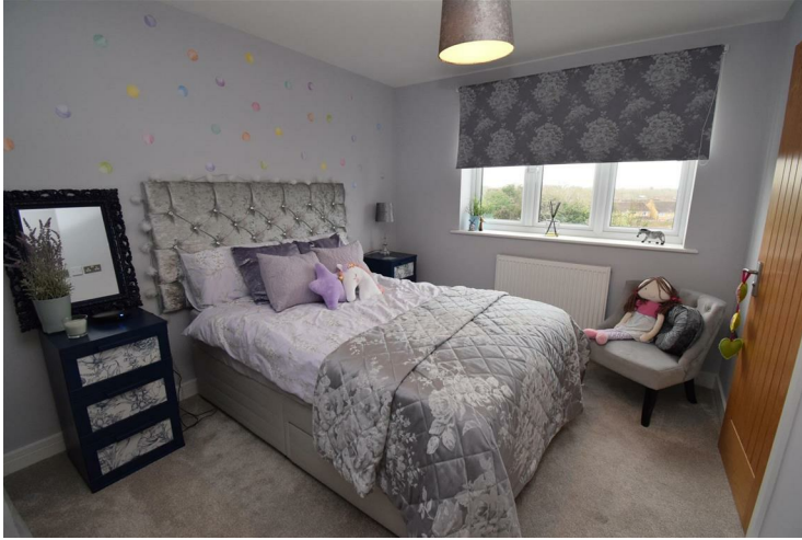
Second double bedroom with a radiator, recessed alcove and rear window. Door to: