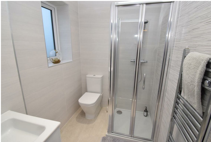
Three piece suite comprising shower, vanity wash hand basin and WC. With a heated towel rail, tiled walls and electric underfloor heating. Double glazed rear window, ceiling spotlights and an extractor vent.