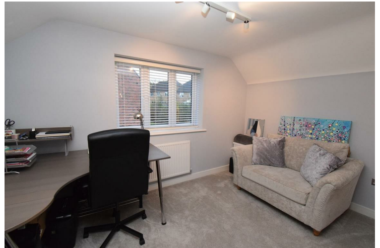
With a recessed storage space, radiator and front window.