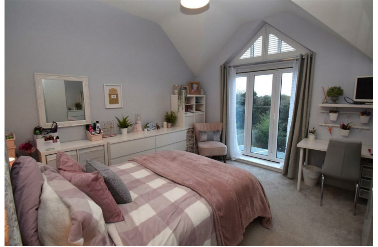
Third double bedroom with a radiator, feature vaulted ceiling and bi-fold doors to the rear elevation.