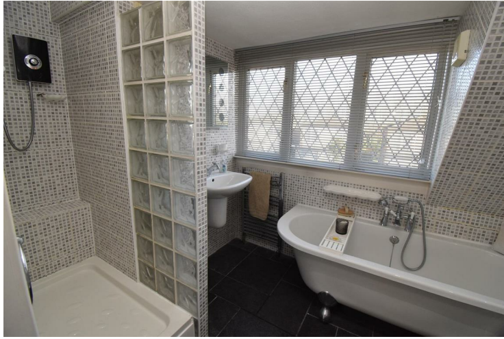
En-Suite Bath/Shower Room 10'9" > 8'0" x 6'5" (3.30 > 2.46 x 1.98)

Stylish four piece suite comprising walk in shower, attractive roll top bath, wash hand basin and WC. Tiled splashbacks and flooring, a heated towel rail, ceiling spotlights, extractor vent and a leaded light double glazed front window.