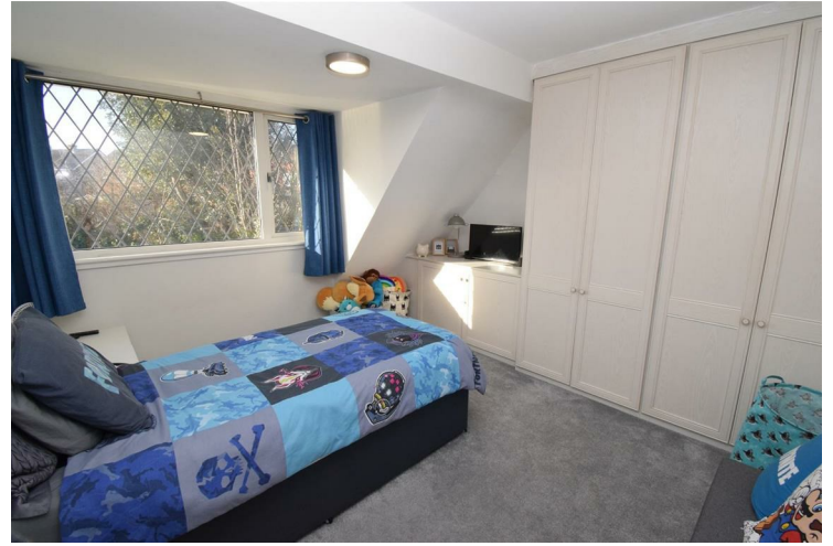
Bedroom 3 11'3" x 11'1" (includes wardrobes) (3.45 x 3.38 (includes wardrobes))

Third double bedroom with range of fitted wardrobes and storage cupboards. A radiator and leaded light double glazed rear window.