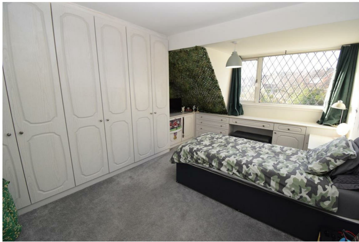
Bedroom 2 14'0" x 11'1" (includes wardrobes) (4.28 x 3.38 (includes wardrobes))

Rear double bedroom with a range of fitted floor to ceiling wardrobes and drawer units. A radiator and leaded light double glazed rear window.