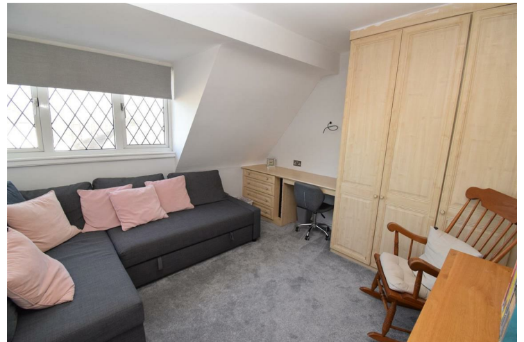
Bedroom 4 11'0" x 10'3" (includes wardrobes) (3.37 x 3.13 (includes wardrobes))

Fourth double bedroom with fitted wardrobes, a desk and drawers. Radiator and a leaded light double glazed front window.