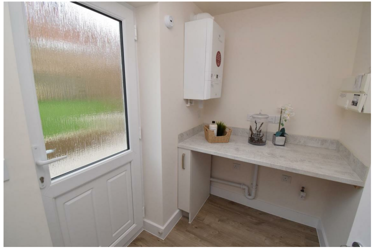
Utility Room 6'7" x 4'8" (2.03 x 1.44)