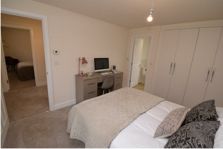
Master Bedroom 13'10" x 9'10" (4.23 x 3.01)