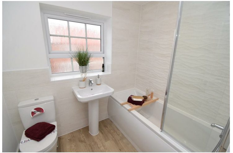
Bathroom 7'1" x 5'6" (2.17 x 1.70)