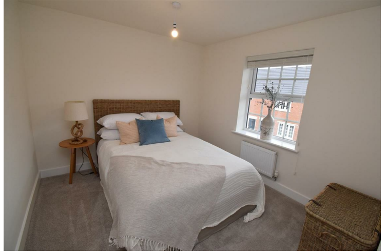
Bedroom 3 10'11" x 9'4" (3.35 x 2.85)