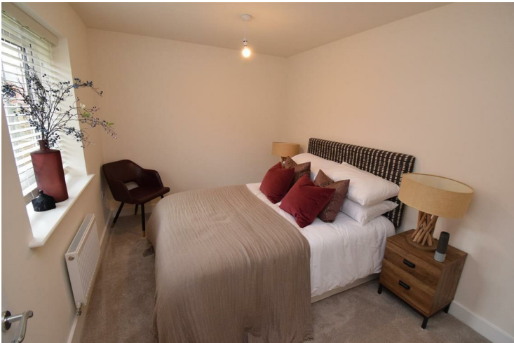
Bedroom 2 10'11" x 8'5" (3.35 x 2.58)