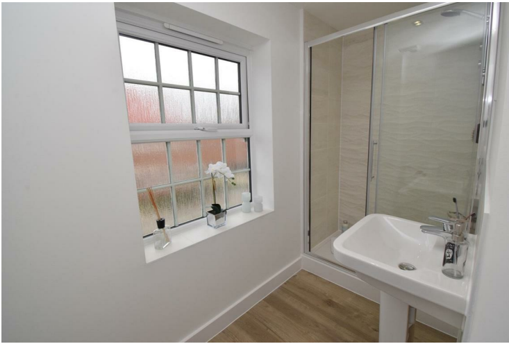
En-Suite 9'10" x 5'10" (3.01 x 1.80)