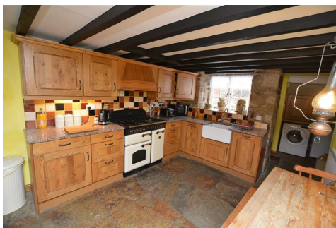
Brookside Road, Derby, DE21 5LF £480,000

**OPEN 7 DAYS A WEEK** HOPKINS & DAINTY of TICKNALL are delighted to offer a rare opportunity to acquire this stunning and quite unique Grade II Listed detached property with NO UPWARD CHAIN.