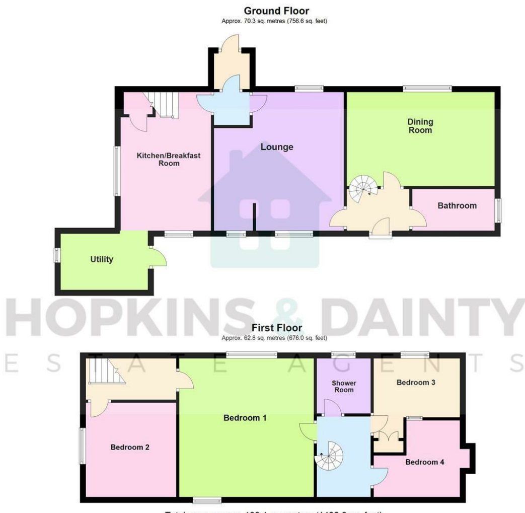
Total area: approx. 133.1 sq. metres (1432.6 sq. feet) Copyright of HOPKINS AND DAINTY ESTATE AGENTS. Plan produced using Plantlp.