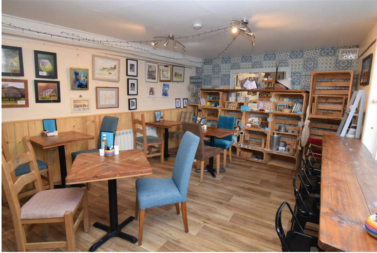
Shop/Dining Area 29'11" x 15'2" > 12'3" (9.13 x 4.64 > 3.74)

On entering the shop, there is a sitting/dining area and general shop space with an electric radiator and large single glazed front windows and the entrance door.