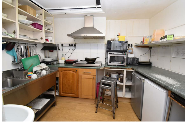
Kitchen 9'7" x 7'6" (2.94 x 2.30)

Fitted with a sink, work surface areas and storage cupboards.