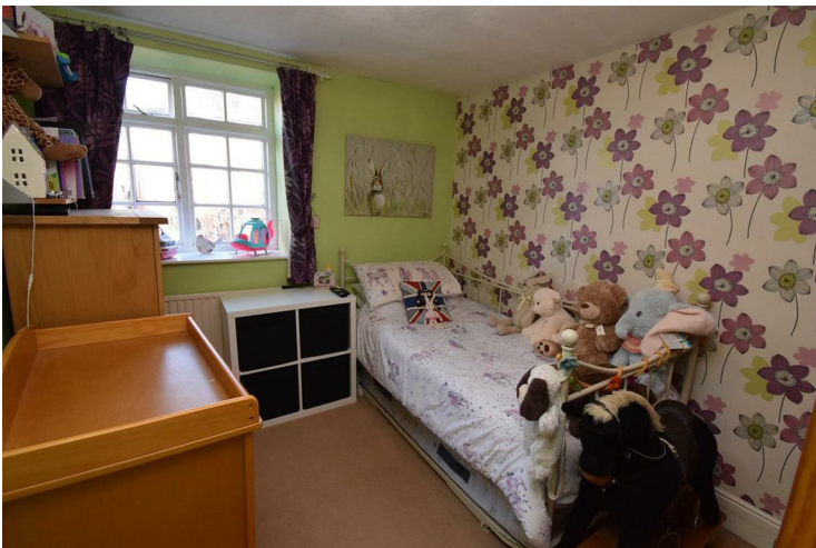
Third bedroom with a radiator and side window.