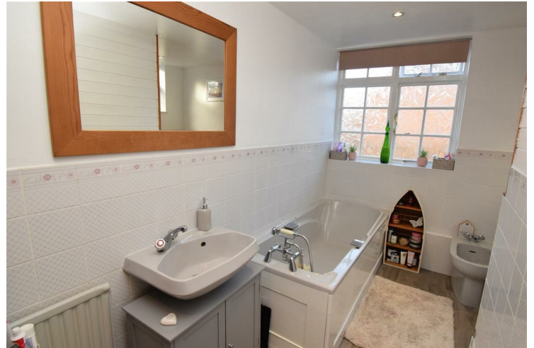
Four piece suite comprising panel bath, WC; bidet and wash hand basin. With tiled splashbacks, a radiator, ceiling spotlights, storage cupboard and side and rear windows.