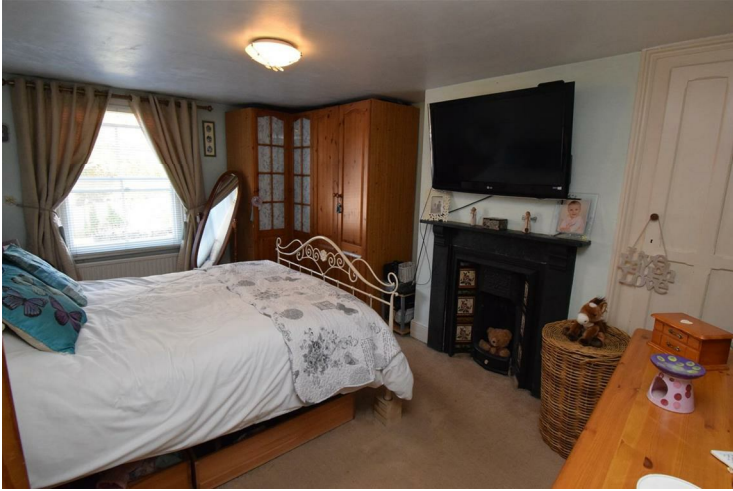
Front double bedroom with a built in wardrobe, feature fireplace, radiator and sash window.