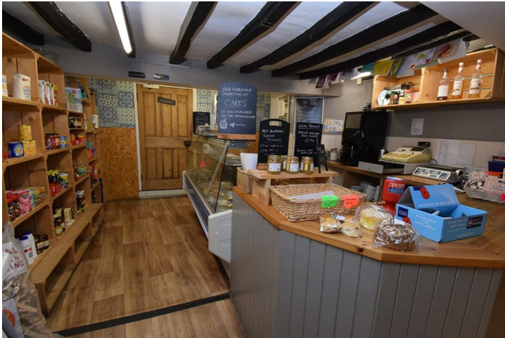
Serving Area 13'8" x 10'8" (4.18 x 3.26)

To the rear, there is a serving area with single glazed side windows and door to the rear hall/store and opening to the kitchen.