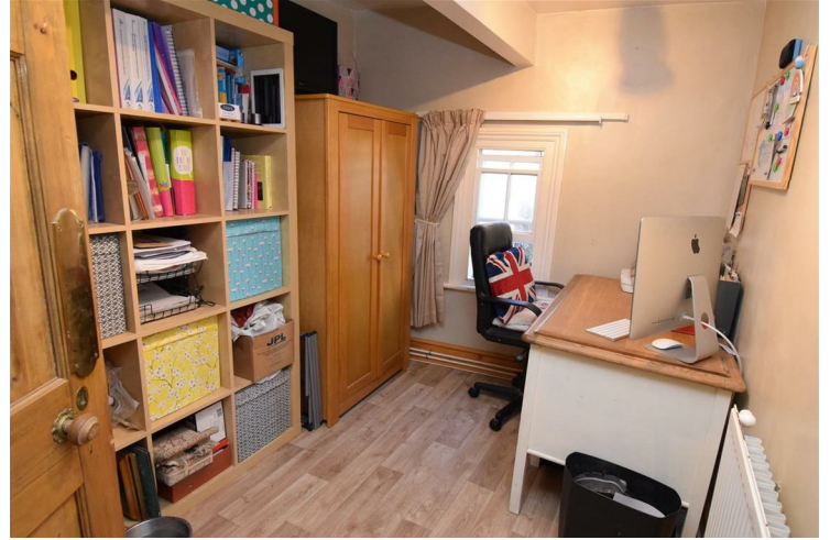
Single fourth bedroom or study, with a radiator and front sash window.