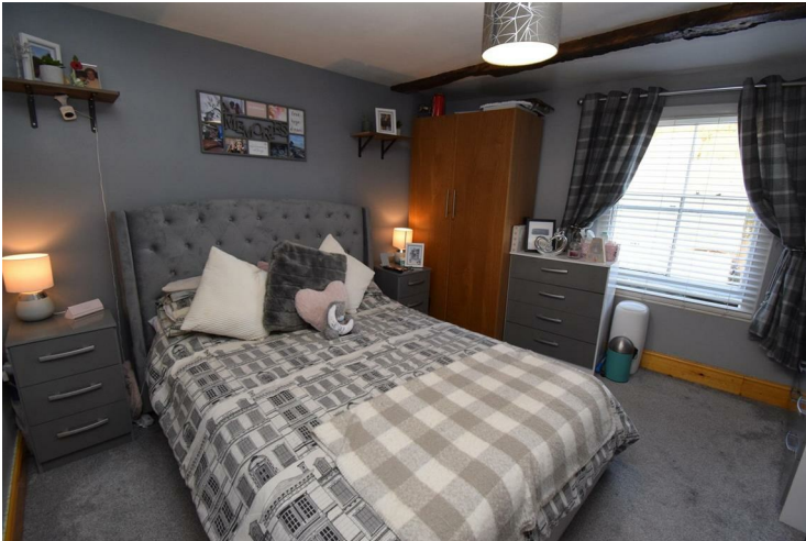
Second double bedroom with a front sash window and radiator.