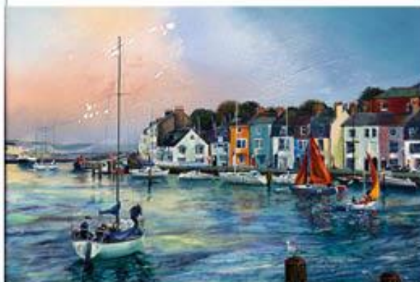
Cover: Olivia Nurrish olivianurrish.com

There is always the possibility of last minute withdrawals or sales prior. Please ensure you have registered your interest and we will endeavour to contact you if the lot is withdrawn or likely to be sold prior to the auction.