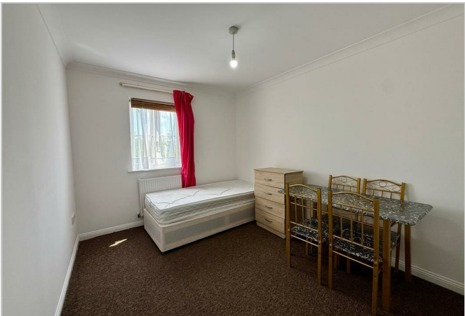
Spacious 2-Bedroom Third Floor Flat – Romford RM2 6GH

Please contact our Letting International LTD Office on 02085549999 if you wish to arrange a viewing appointment for this property or require further information.