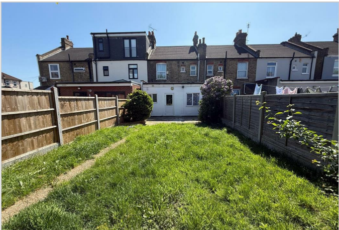
Spacious 2-Bedroom Ground Floor Flat with Garden – Newbury Park IG2

Please contact our Letting International LTD Office on 02085549999 if you wish to arrange a viewing appointment for this property or require further information.