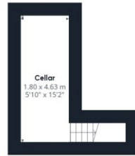
Floor -1 Building 1