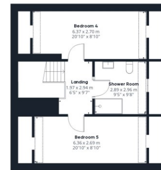
Floor 3 Building 1