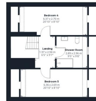
Floor 3 Building 1