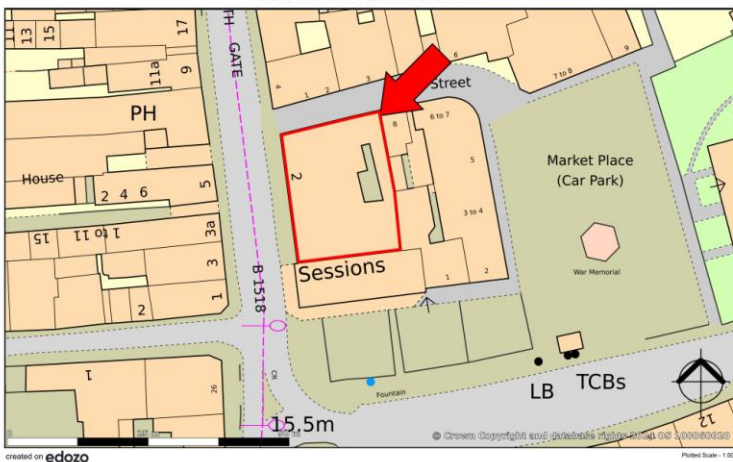
Lloyds Bank plc, 2 Northgate, Sleaford, NG34 7BL

The property is understood to be let on a Full Repairing & Insurance Lease for a term of 5 years, which commenced on 24 th June 2021 at an annual rent of £26,000 per annum exclusive.