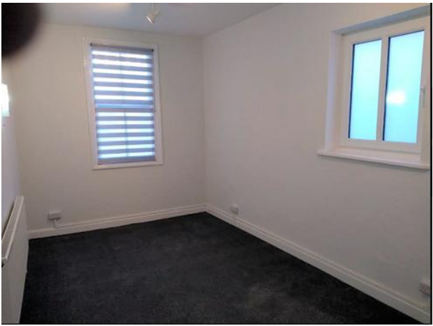
First Floor (F3)

Regulated by RICS. Mundys is the trading name of Mundys Property Services LLP registered in England NO. OC 353 705. The Partners are not Partners for the purposes of the Partnership Act 1890. Registered Office 29 Silver Street, Lincoln, IN2 1AS.