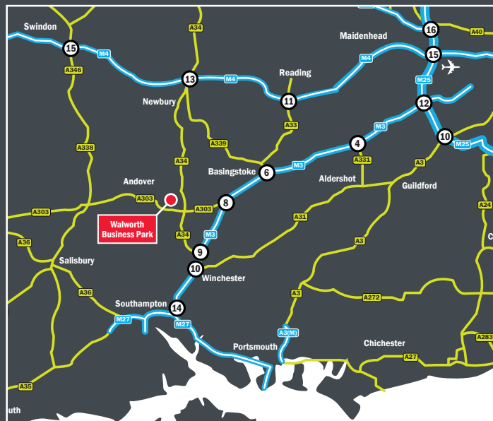
Plot 81A | Andover | SP10 5NP