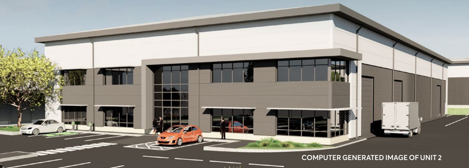
COMPUTER GENERATED IMAGE OF UNIT 2