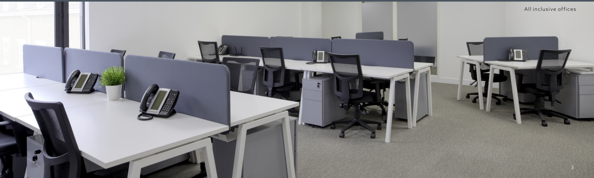
All inclusive offices