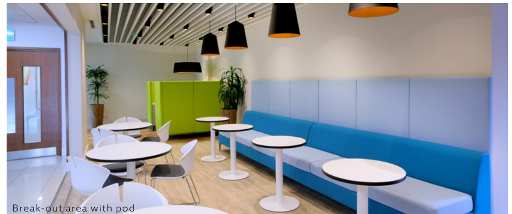
Break-out area with pod