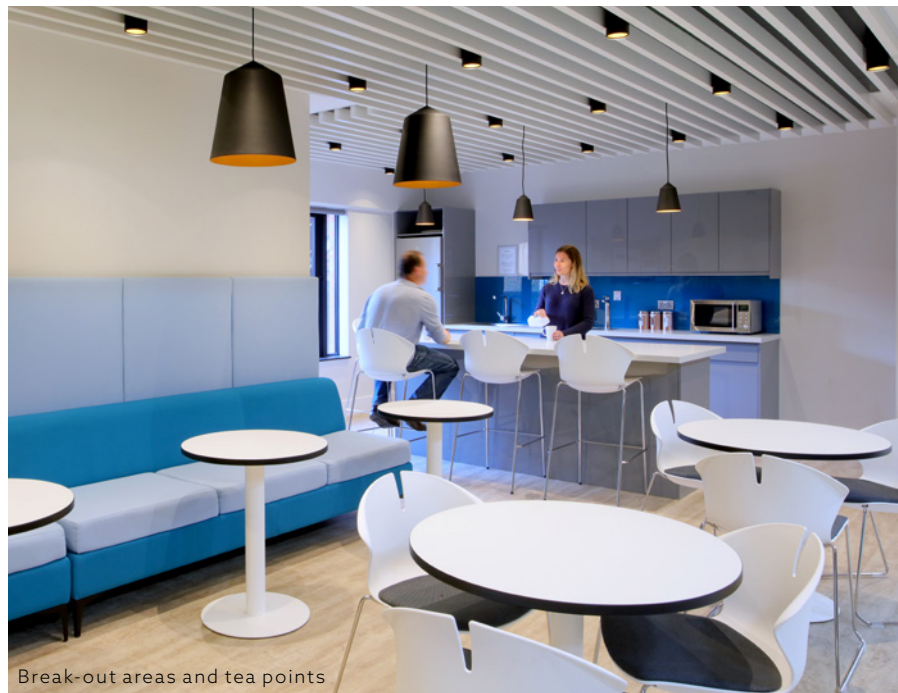
Break-out areas and tea points

Fully-inclusive packages provide you with all you need to start work, on flexible contract terms that offer the ability to expand as your business grows. All within a fixed monthly cost.