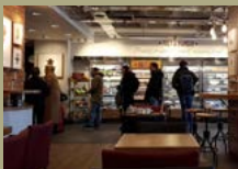
Pret Station Hill