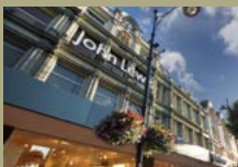
John Lewis Broad Street