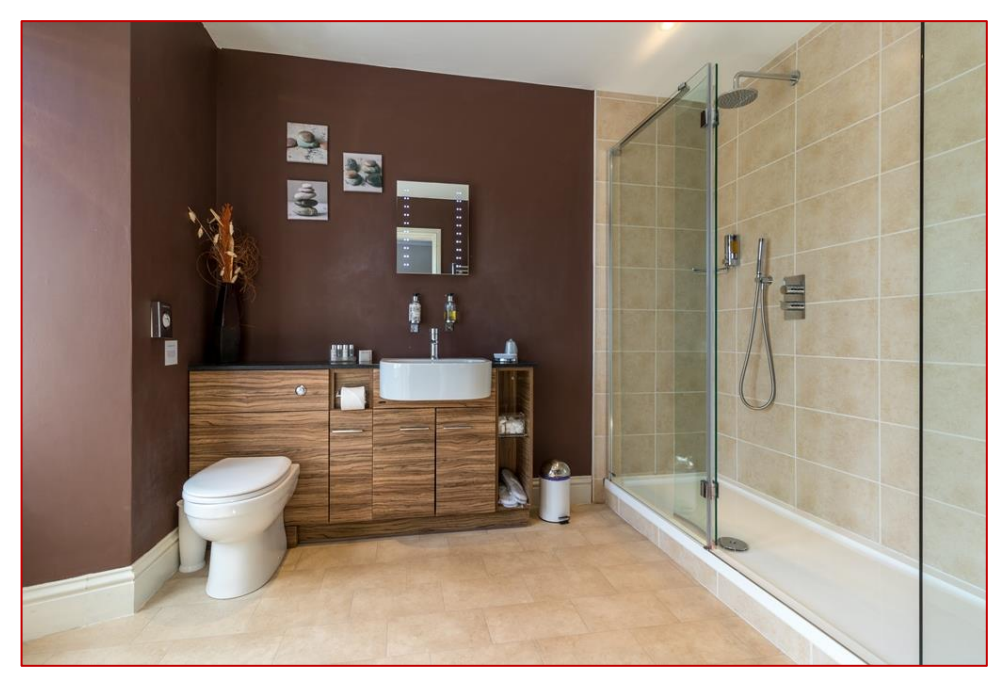
The Ravensworth Hotel, Ambleside Road, Windermere, LA23 1BA