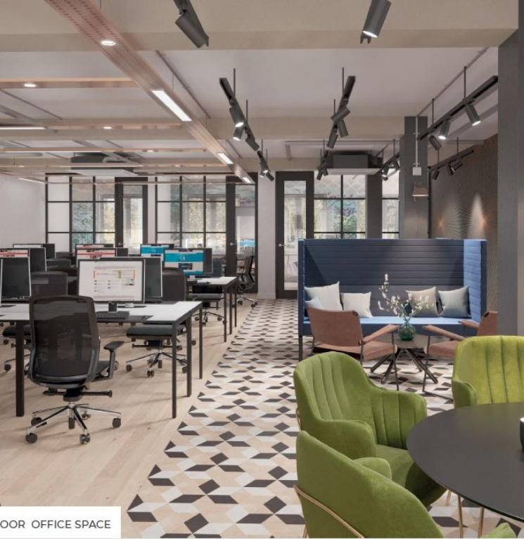
LOOR OFFICE SPACE