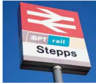
8 mins walking distance