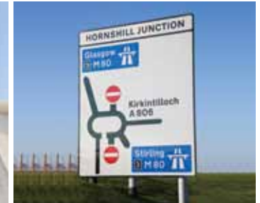
11 mins drive to Glasgow