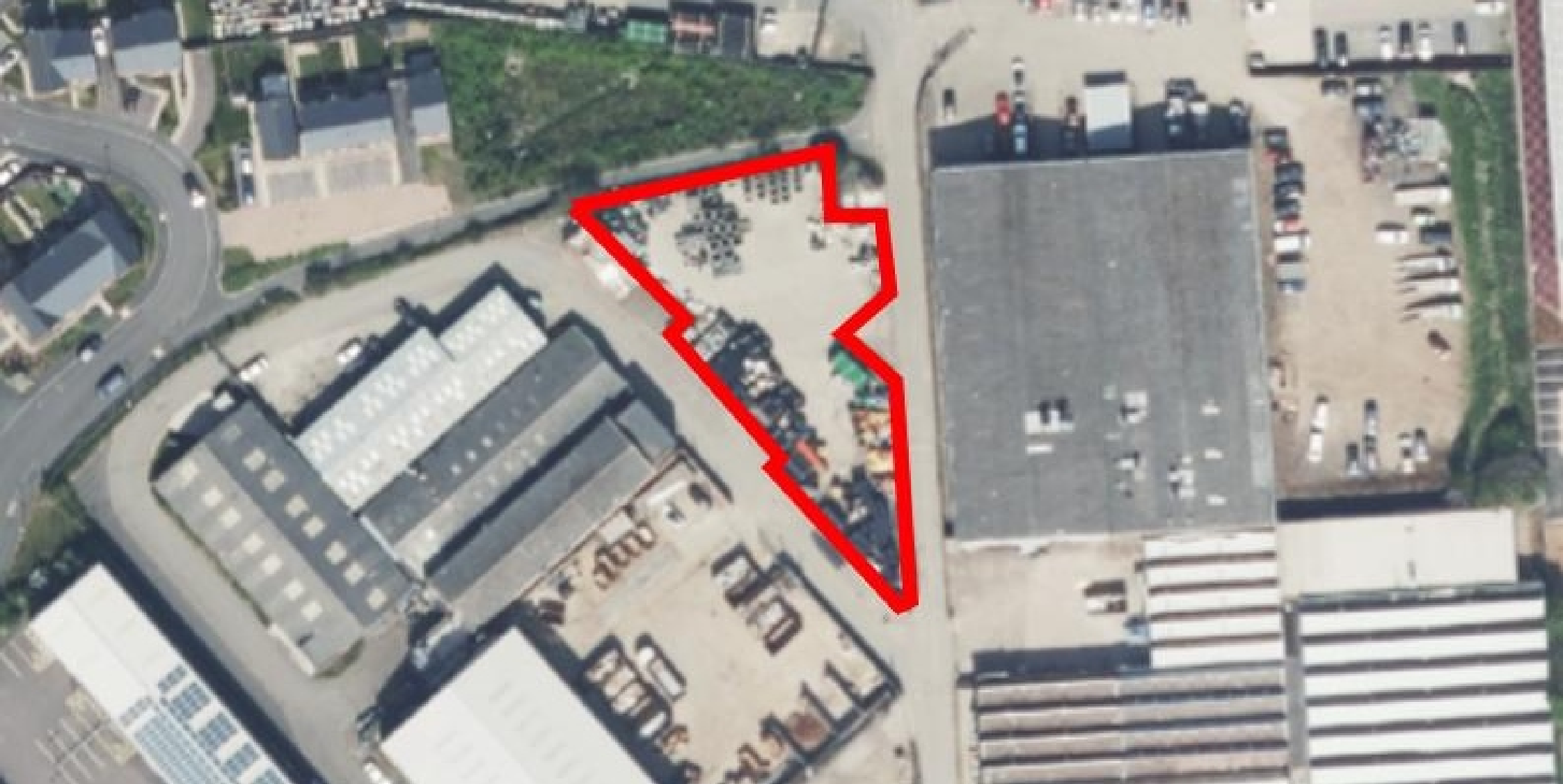
Storage Land, Lock Lane, Warwick CV34 5AG