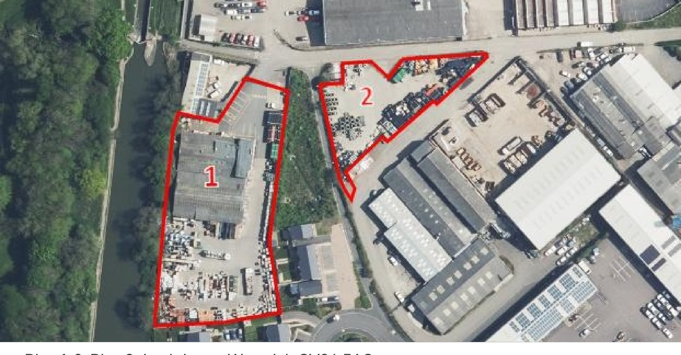
Plot 1 & Plot 2, Lock Lane, Warwick CV34 5AG