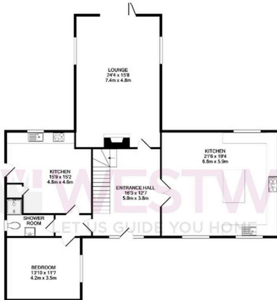
GROUND FLOOR APPROX. FLOOR AREA 1450 SQ.FT. (135.6 SQ.M.)