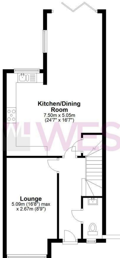
Ground Floor Approx. 55.0 sq. metres (591.6 sq. feet)