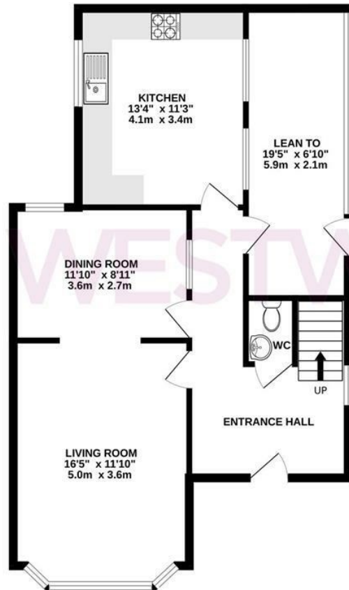
GROUND FLOOR 730 sq.ft. (67.8 sq.m.) approx.