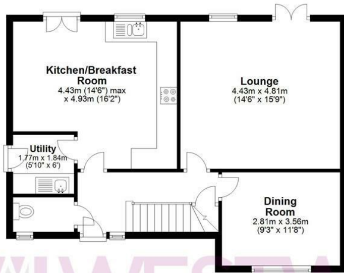
Ground Floor Approx. 65.8 sq. metres (708.1 sq. feet)