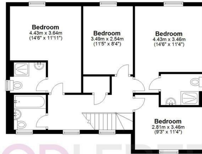
First Floor Approx. 65.7 sq. metres (707.0 sq. feet)