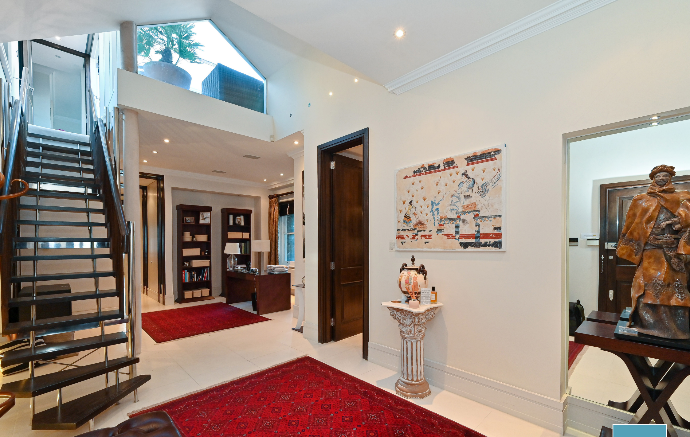
WASHINGTON HOUSE, BASIL STREET, LONDON, SW3