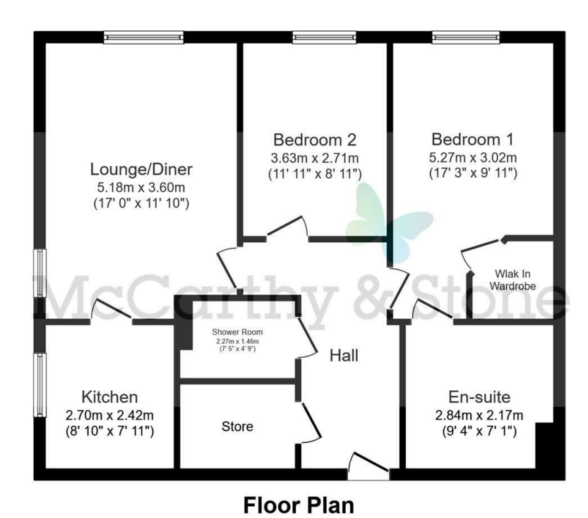
This floor plan is for illustrative purposes only. It is not drawn to scale. Any measurements, floor areas (including any total floor area), openings and orientation are approximate. No details are guaranteed they cannot be relied upon for any purpose and they do not form part of any agreement. No lability is taken for any error, omission or misstatement. A party must rely upon its own inspection(s). Plan produced for McCarthy & Stone. For every depth with Cocalagent. Com