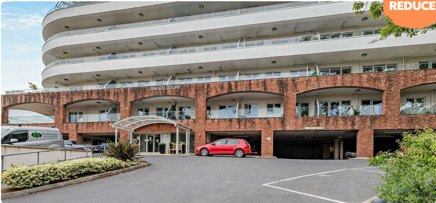
Singer Court, Manor Crescent, Paignton Approximate Gross Internal Area 609 Sq Ft/57 Sq M