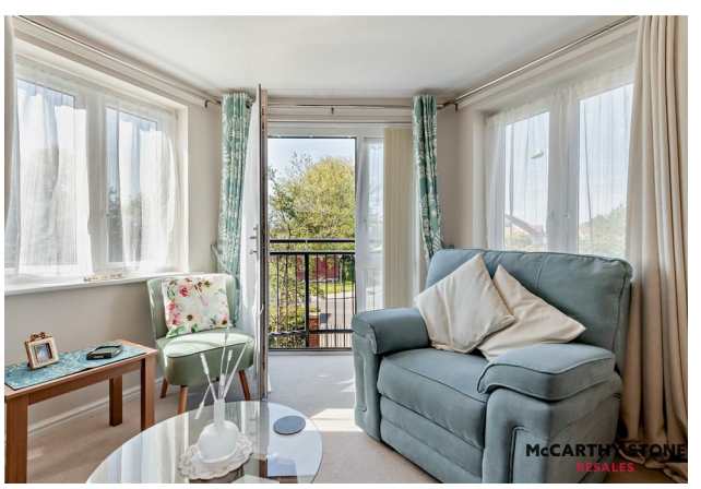
BEAUTIFUL AND SPACIOUS - This stunning first floor one bed Retirement Apartment offers an abundance of light and space thanks to its favorable position within the development.