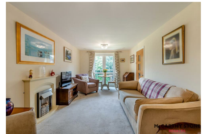
A BRIGHT SPACIOUS ONE BEDROOM SECOND FLOOR APARTMENT with JULIET BALCONY, adjacent to the lift for easy access and overlooking the communal gardens.

Oak Grange is a MUCH SOUGHT after age exclusive MCCARTHY STONE DEVELOPMENT for the OVER 60'S in the HEART of the delightful village of HARTFORD.