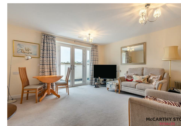
PREMIUM THIRD FLOOR APARTMENT

This is a spacious two bedroom property with a large walk out balcony offering extensive views of the surrounding area and communal gardens. Exclusively for the OVER 70'S MCCARTHY STONE RETIREMENT LIVING DEVELOPMENT, centrally located to ILKLEY RAILWAY STATION, HOSPITAL and TOWN CENTRE, with bus stops directly outside the development.