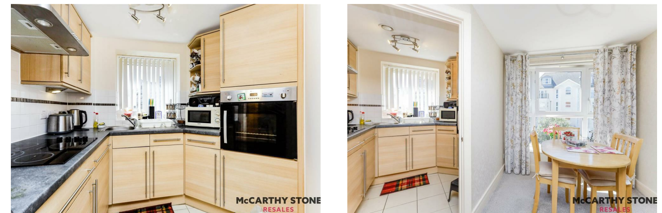
A ONE BEDROOM SECOND FLOOR RETIREMENT APARTMENT