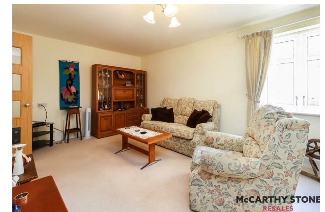
Luxury GROUND floor ONE BEDROOM retirement apartment in our prestigious STIPERSTONES COURT development.

This beautiful apartment must be viewed to fully appreciate the accommodation on offer.