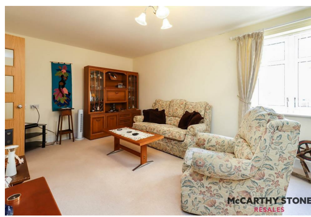
*JOIN US FOR COFFEE & CAKE – FRIDAY 5TH JULY – 10am – 4pm – BOOK YOUR PLACE TODAY!

Luxury GROUND floor ONE BEDROOM retirement apartment in our prestigious STIPERSTONES COURT development.