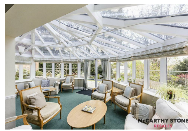
ENJOY LUNCH ON US WHEN YOU TAKE A TOUR OF PORTMAN COURT - BOOK NOW!

A WONDERFULLY presented one bedroom second floor retirement apartment. The development offer EXCELLENT COMMUNAL FACILITEIS including a restaurant, landscaped gardens and communal lounge where SOCIAL EVENTS take place.